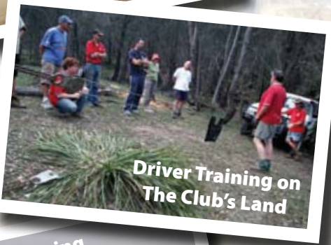
Sand Driver Training