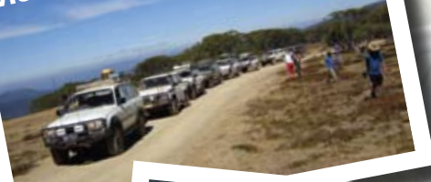
Victorian High Country

General Meetings of The Nissan Patrol 4WD Club are held at 8:00pm on the second Wednesday of the month at The Veteran Car Club of Australia 134 Queens Road Five Dock