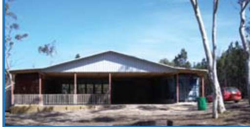
"The Shed" on the Club's Land

All Club trips are graded to allow Members to choose one that suits their level of driver or vehicle ability, confidence or comfort. Varying from day trips to multi week "treks", our trips are led by experienced members, trained in trip organisation. Each November the Club hosts the Nissan Trials, the premier inter-club event on the 4WD Clubs competition calendar. The Nissan Trials tests the skill of drivers, navigators and vehicles to the limits.