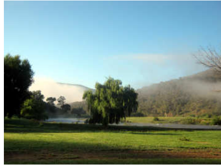
Wonnangatta Caravan Park