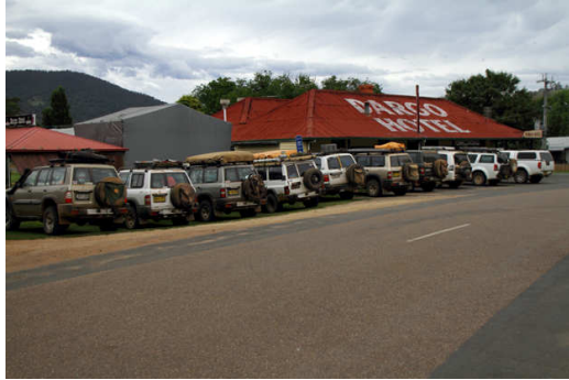
Group Photo Dargo