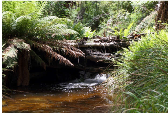
Flowing Stream along track

After stopping for lunch we continued on to the Blue Rag track. It was an incredible trip along the spur up to a trig station with panoramic views of the area, an absolutely amazing track. The landscape after the fire was truly awesome. Slender grey poles of the gums which had not regrown after the fires and lush regrowth on the forest floor could be seen all around. We headed back down to The Great Alpine Road and stopped to pump up our tyres as the kiddies caught frogs in the pond nearby. It was here we said goodbye to Bob and Sandra, Neil, Karen, Tim and Mitch as well as Fred and Robert.