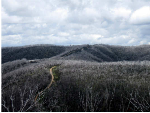
Blue Rag Track after fire