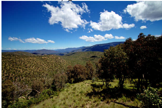
Lookout on Barry Way