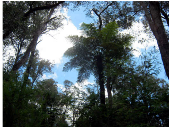
Tree Ferns in the Forest

After lunch we continued along the Cobberas Track and found ourselves some very difficult terrain, from which 3 vehicles required a snatch. The mighty Vimmy won the award for highest revs to get up the hill. However the poor pathfinder had the hardest job of pulling out the 100 Series Land cruiser. However I would like to take the opportunity to acknowledge how mighty Patrols are, seeing they all made it up UNASSISTED!