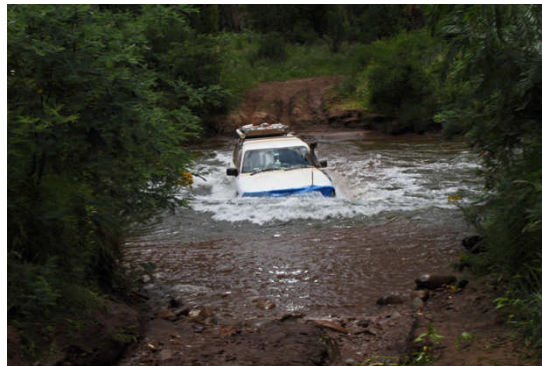
Lance crossing the Dargo River

We headed down Stock route crossing over the deep and fast flowing Dargo river. Julia and Matthew waded across checking out the rocks, depth and strength of the flow to help the trip leaders pick their line. Some cars used blinds. The river was over a meter deep and fast flowing. The water came up to nearly drivers window level on a lifted Patrol on the upstream side. After an eventful crossing we stopped shortly up the track for lunch, where the kids had found some chairs carved out of wood and spent most of lunch arguing over who got to sit in the chairs. Ben and Matt ended up in the chairs most of the time. We then headed towards Harrison's cut. It was beautiful to see all the fast white water moving into the equally fast flowing Dargo river.