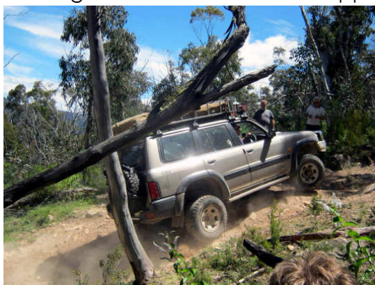
Vimmy using all its revs

Those eager enough woke early for a swim in the snowy river, yoga or a walk. After a leisurely pack-up we left Willis campground at 9.00am and headed along Barry way for another 10kms with tyres at 28 psi. We then turned onto the Ingeegoodbee Track. After a short drive we arrived at Mt. Menaak. This mountain being 1000 meters high meant panoramic views accompanied by phone reception, so both cameras and phones were out making the most of the occasion. The tyres were also reduced another 4psi. before we were on the road again. After continuing along Ingeegoodbee track for some time, we took a left onto McFarlane Flat Track. We followed this track through crossings of both the Ingeegoodbee River and then the Merrima River. After crossing the Merrima River we stopped for lunch.